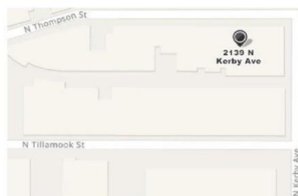
Atkinson MBA for Professional